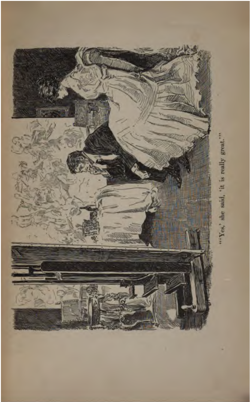
“‘Yes,’ she said, ‘it is really great.’”